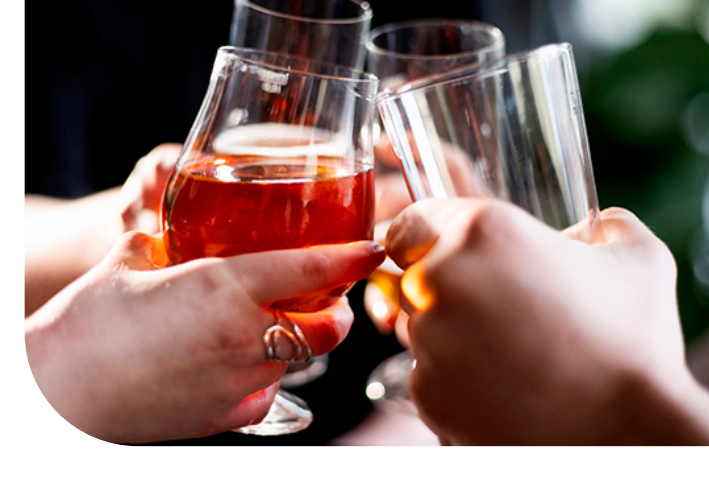
Craft brewing: Add our expertise and professional brewing equipment to your energy for craft brewing. Alfa Laval can help you on your unique craft brewing journey and overcome challenges. It may be the need for quality consistency, growing production target, or whether you could, actually, be doing something better?

And that diversification is happening within the 'traditional' beers on offer, with distinct current trends. Hazy, Session and West Coast IPAs are definitely in the ascendancy, with more lager also being brewed at the craft level.