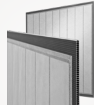
Alfa Laval LowResist MBR technology

The systems offer maximum resource recovery, minimal costs and a circular-economy operational model.