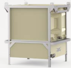
Alfa Laval LowResist MFM080 module

When you have between 8,000 and 11,000 people visiting your treasured historic site every day during the hot summer months, managing the attraction in a sustainable way is absolutely key.