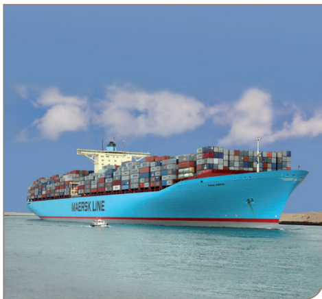
EMMA MÆRSK equipped with the Alfa Laval Aalborg XS-TC7A waste heat recovery economizer.