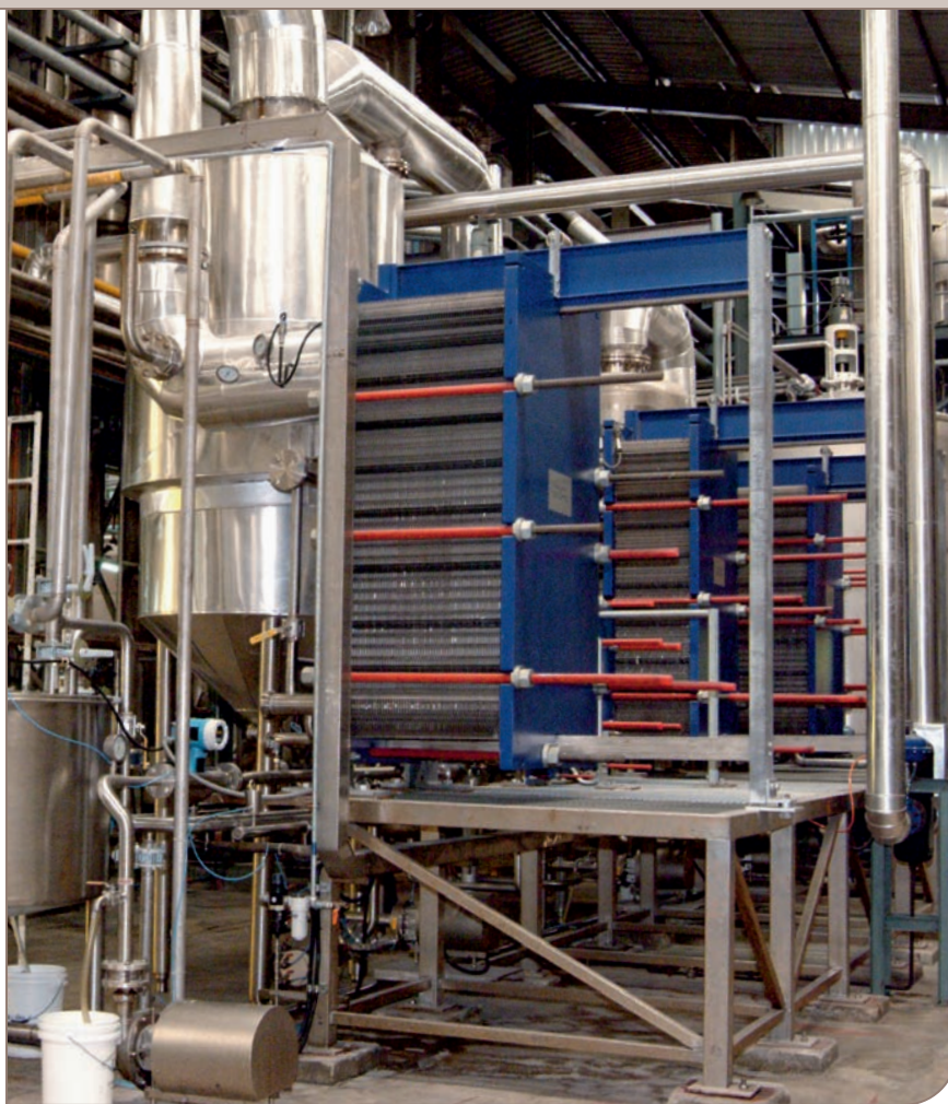
Three-effect AlfaVap plate evaporator system for fructose installed at Thai Glucose Co. Bangkok.

Established in 1987, Thai Glucose is continuously working to improve its production processes. Installing AlfaVap evaporators is part of this strategy.