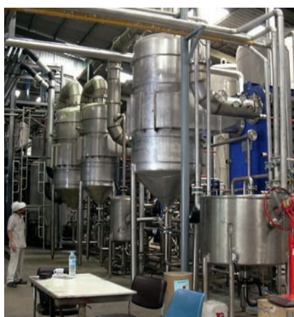
Two-effect AlfaVap plate evaporator system for dextrose and maltose.

accurate temperature control and, thus, high product quality.