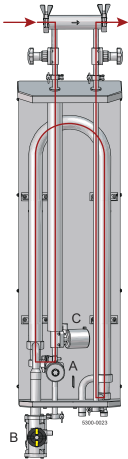
Figure 1. Stand-by mode

The velocity in the main line must be >1.0 m/s in order to achieve a turbulent flow during stand-by mode.