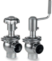
Unique SSV Manual