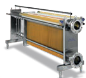
Plate and frame module