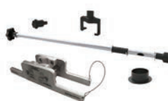
Service tools mixing and blending