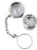
SB Micro Sample Port Type M