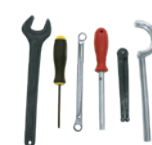
Service tools tank cleaning