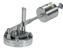
SB Pressure Relief Valve