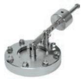
SB Anti Vacuum Valve