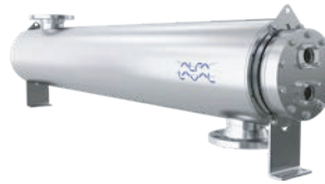
Pharma-line S and P