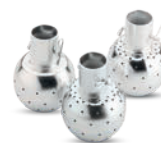
LKRK Static Spray Ball