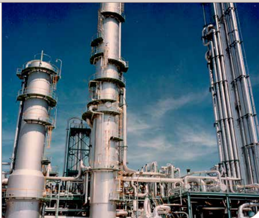
A Compabloc operates with a crossing temperature program and a temperature approach as low as 3°C (5.4°F). So significantly more energy is recovered than with shell-and-tube heat exchangers.

The company's engineers searched for a solution where fouling could be completely eliminated during cleaning, and efficiency maintained over time.