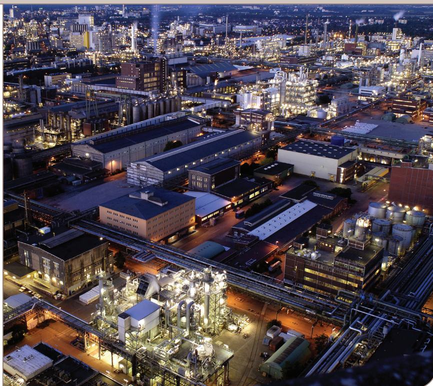
Aerial view of a section of the BASF site in Ludwigshafen, Germany

At BASF's acetylene and naphthalene plant in Ludwigshafen, Germany, a steadily growing number of Alfa Laval Compabloc heat exchangers have been delivering safety, reliability – and lower costs since 1993. The first installation was followed by 25 more over the last 21 years – with the most recent commissioning in 2013.