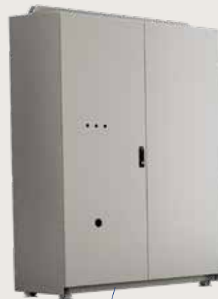
Lamp drive cabinet