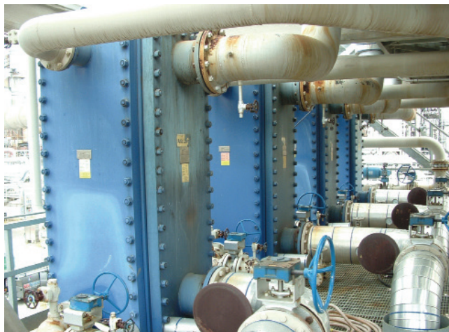
Four of the eight Compabloc condensers.

The Compabloc units have been in continuous operation since they were commissioned in the middle of 2002. According to Dr Wonchala, the main reason for starting this project was to save energy. Compabloc condensers provided the most economical solution for using advanced alloys to avoid corrosion and to achieve the degree of heat recovery that Shell was looking for.