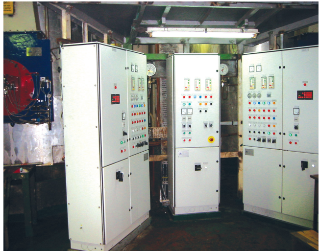
Alfa Laval Aalborg replaced the burner and control system on board Vietsov-petro's FPSO "Ba Vi". A KBSA™ steam atomizing burner was installed on the existing boiler.

In case of upgrading to a more advanced control system, Alfa Laval Aalborg provides technical advice on the various solutions available in the market.